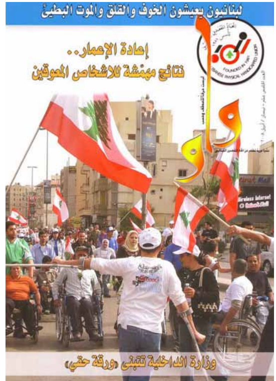
LPHU - Waw magazine

Fact-based lobbying led to a new electoral law in September 2008 that stipulated provisions to improve accessibility to polling stations, thus allowing persons with disabilities to exercise their right to vote on equal grounds with all Lebanese citizens (USAID 2008). Advocacy and lobbying from disabled persons' organizations and NGOs have contributed to the inclusion of the disability dimension in the National Education Five-Year Plan 2010–2015 (Ministry of Education and Higher Education 2010).